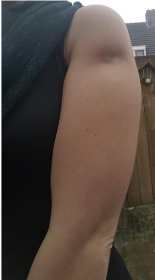
Case 1, picture used with permission of the patient